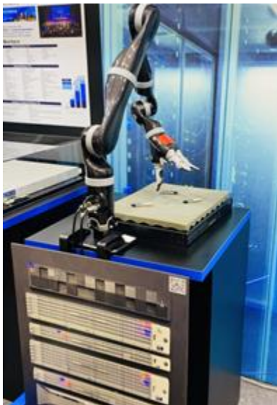
Robot data centre exhibit in IGF Village

For more photos, please visit: IGF-Internet Governance Forum's albums | Flickr