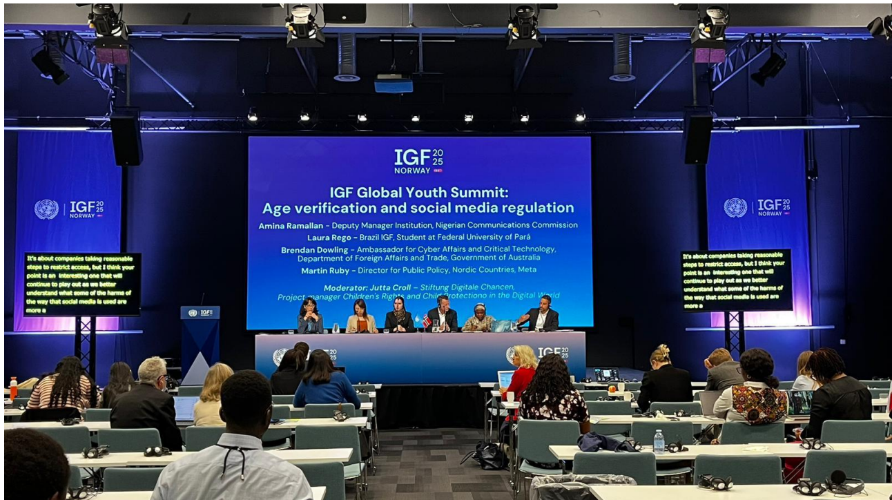
IGF 2025 Global Youth Summit in Lillestrøm, 23 June

Summit at the 20th IGF in Riyadh, with two more to be hosted at the APrIGF in Nepal and Youth LACIGF later in the year. The track has focused on social media regulation, particularly regulation through age verification, unpacking various aspects of AI governance and engaging over thousands of young people.